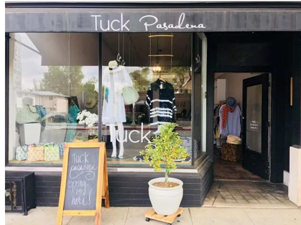
Tuck Pasadena 1385 E. Washington Blvd. Women's Clothes Learn More